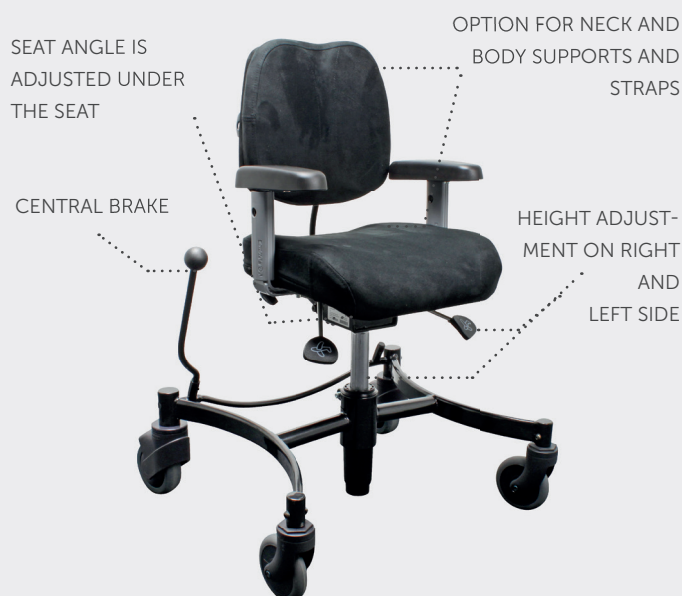
Examples of features on VELA Hip Hop 100

A complete list of accessories is available at www.vela.eu .