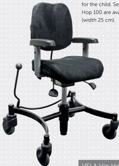
VELA Hip Hop 100

VELA Hip Hop 100 is also available with a footplate. Enabling a child to have their feet on the "floor" helps them to remain still in a sitting position and offers greater safety, as the child cannot rock the chair.