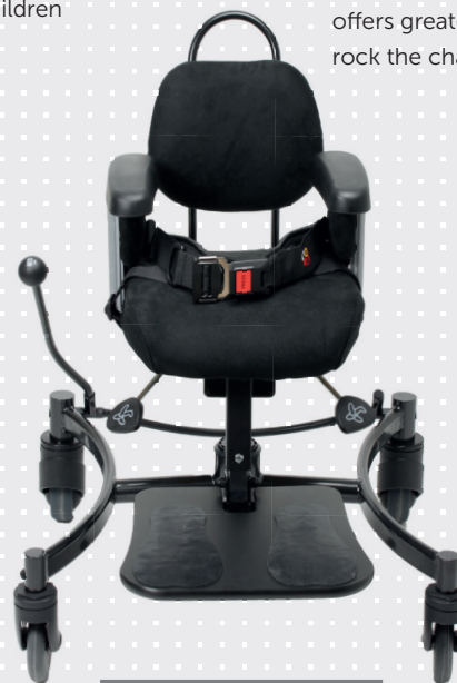
VELA Hip Hop 100